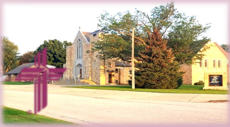
St Matthew Lutheran Church 504 Walnut Street