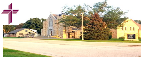
St Matthew Lutheran Church 504 Walnut Street Mapleton, IA 51034

In His Footsteps: Kindness is a virtue given by the Lord, and joy is its reward. He will show you the way and you will be safe and secure. Show Kindness to others.