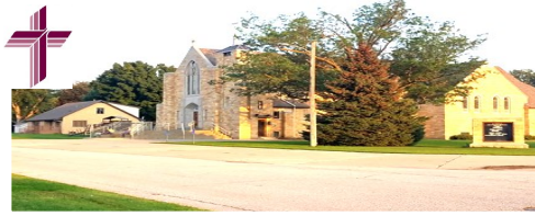
St Matthew Lutheran Church 504 Walnut Street Mapleton, IA 51034

In His Footsteps: When you feel down and blue there is always one door opened to you, prayer, God will meet you there. Open it share it