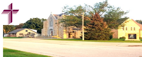
St Matthew Lutheran Church 504 Walnut Street Mapleton, IA 51034

LET'S STAY CONNECTED OPPORTUNITIES FOR YOU TO CONTINUE TO FILL UP WITH JESUS BY READING AND LISTENING TO THE BIBLE: St. Matthew Lutheran Church Service at 9:30 am every Sunday am at the church. Facebook page-.St. Matthew Lutheran-Mapleton— Our services at 9:30 am every Sunday website: www.stmatthewmapleton.org — Our services posted weekly Mission Central... www.missioncentral.us Lutheran Family Service: www.lfsiowa.org WEB SITES: Iowa District West — www.idwlcms.org Camp Okoboji — www.campokoboji.org “THE STRONG WORD” is a daily devotion airing at 6:25 am Monday through Saturday on KDSN (104.9 FM) “THE LUTHERAN HOUR” can be heard every Sunday on radio station—KDSN-FM (104.9) at 6:30 am and 1530 at 10:30 am. It is available 24 hours a day on the internet in Real Audio. Visit www.lhm.org and click on the Lutheran Hour on the left side of the page “THE GOOD SHEPHEARD HOUR airs on the following stations every Sunday: 8 am Fort Dodge-KVFD 1400 AM; 8 am Sioux City—KSCJ 1360 AM; 10:30 am Storm Lake—KAYL 101.5 FM Lutheran Family Services: www.lofsiowa.org MainStreet Living — is a Television Program that is endorsed by the Iowa West District of the LCMS This program is broadcast on KCAU, the ABC network affiliate in Sioux City on Sunday morning, starting at 10:00 AM. The first 30 minutes are remastered episode of “This is the Life” The second half of the program is a modified Lutheran worship service that features a different Pastor each week, from the area.