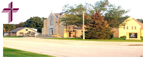
St Matthew Lutheran Church 504 Walnut Street Mapleton, IA 51034

LET'S STAY CONNECTED OPPORTUNITIES FOR YOU TO CONTINUE TO FILL UP WITH JESUS BY READING AND LISTENING TO THE BIBLE: St. Matthew Lutheran Church Service at 9:30 am every Sunday am at the church. Facebook page-.St. Matthew Lutheran-Mapleton— Our services at 9:30 am every Sunday website: www.stmatthewmapleton.org — Our services posted weekly Mission Central... www.missioncentral.us Lutheran Family Service: www.lfsiowa.org WEB SITES: Iowa District West — www.idwlcms.org Camp Okoboji — www.campokoboji.org “THE STRONG WORD” is a daily devotion airing at 6:25 am Monday through Saturday on KDSN (104.9 FM) “THE LUTHERAN HOUR” can be heard every Sunday on radio station—KDSN-FM (104.9) at 6:30 am and 1530 at 10:30 am. It is available 24 hours a day on the internet in Real Audio. Visit www.lhm.org and click on the Lutheran Hour on the left side of the page “THE GOOD SHEPHEARD HOUR airs on the following stations every Sunday: 8 am Fort Dodge-KVFD 1400 AM; 8 am Sioux City—KSCJ 1360 AM; 10:30 am Storm Lake—KAYL 101.5 FM Lutheran Family Services: www.lofsiowa.org MainStreet Living — is a Television Program that is endorsed by the Iowa West District of the LCMS This program is broadcast on KCAU, the ABC network affiliate in Sioux City on Sunday morning, starting at 10:00 AM. The first 30 minutes are remastered episode of “This is the Life” The second half of the program is a modified Lutheran worship service that features a different Pastor each week, from the area.