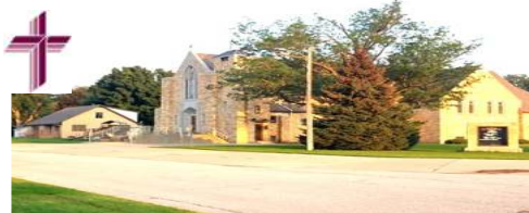
St Matthew Lutheran Church 504 Walnut Street Mapleton, IA 51034