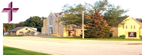
St Matthew Lutheran Church 504 Walnut Street Mapleton, IA 51034