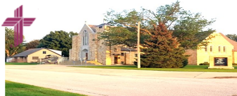
St Matthew Lutheran Church 504 Walnut Street Mapleton, IA 51034