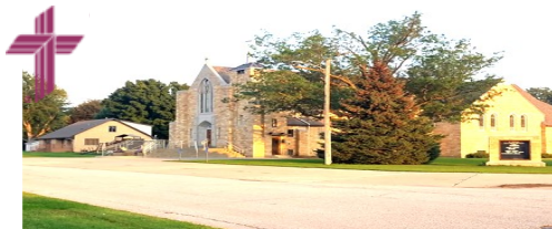
St Matthew Lutheran Church 504 Walnut Street Mapleton, IA 51034